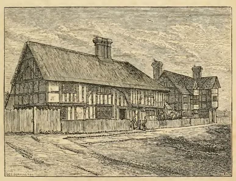
THE MANOR HOUSE OF THE CHALLONERS.