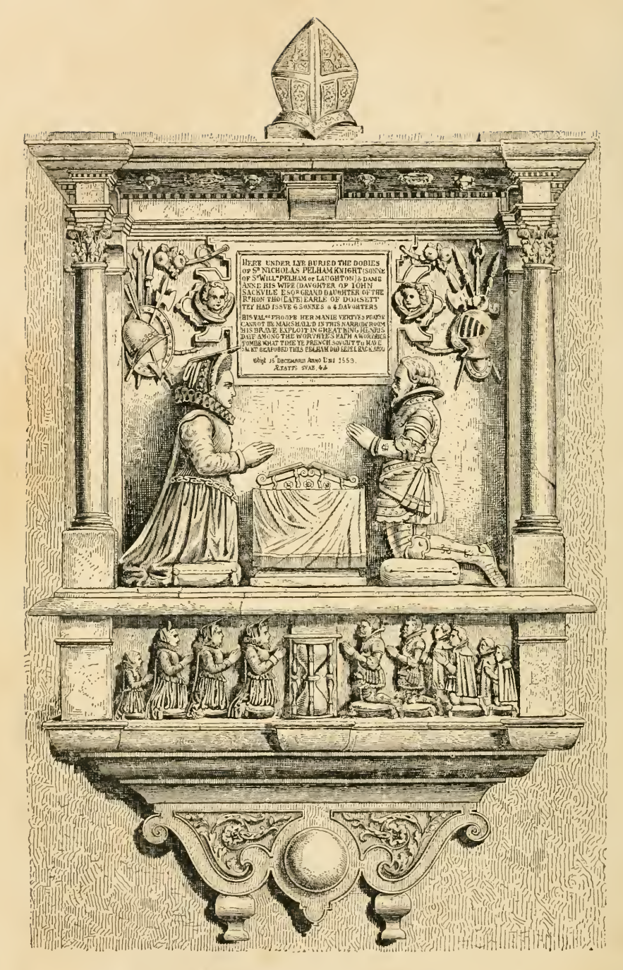
THE PELHAM MONUMENT, IN ST. MICHAEL'S CHURCH, LEWES.